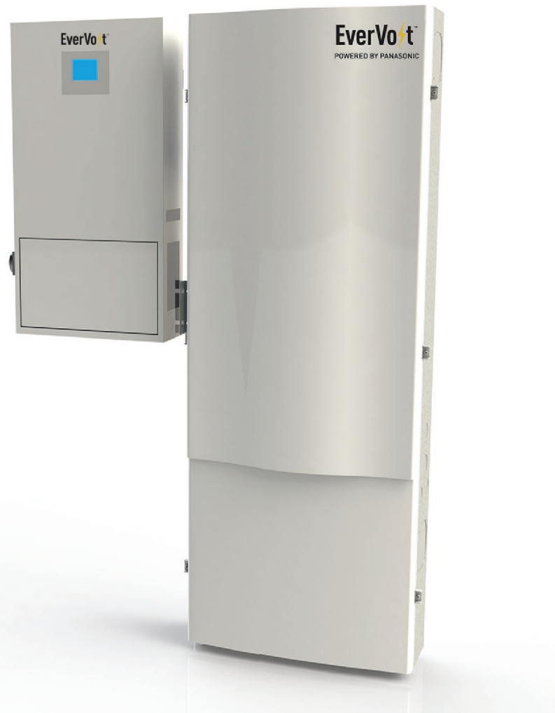
AC coupled version shown above. DC coupled system available in black only.